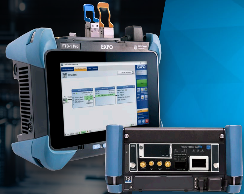
FTBx-88481 in the FTB-1 Pro

The FTBx-88480 Series enables busy technicians to move smoothly and expertly between testing different rates (1G-400G), interfaces (including coherent) and transceiver types—all with a single, compact platform. Available in three configurations, the series is supported across EXFO's portable and rackmount platforms. Plus, it's software-upgradeable to 800G.