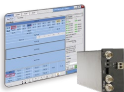
SONET/SDH test modules FTB-8115 – FTB-8120 FTB-8130 – FTB-8140