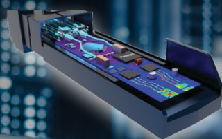
Integration into Linear Pluggable Optics