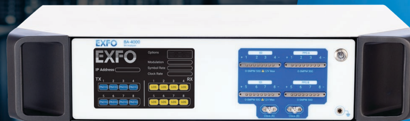
BA-4000 800G Bit Error Rate (BER) tester